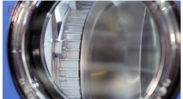
Figure 9. Impeller rotating at reduced speed — observe rotation direction matches the airflow arrow identified at Step 4.