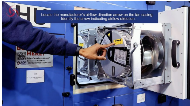
Figure 5. Locating the manufacturer's airflow direction arrow on the fan casing.