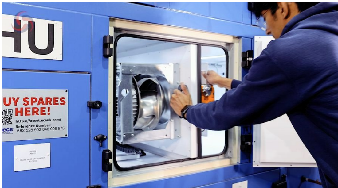
Figure 7. Sliding the diaphragm plate back into the fan section and seating it fully before closing the access door.

Never run the fan with the diaphragm plate partially extended.