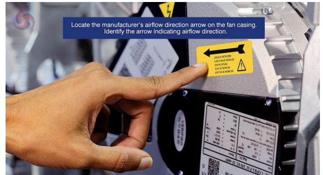
Figure 6. Close-up of the airflow direction arrow used to determine the correct impeller rotation direction.