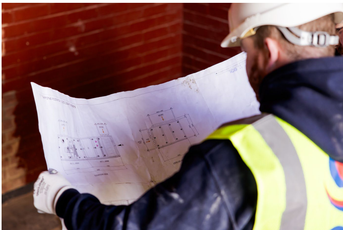
Figure 2. Site personnel in PPE reviewing the certified drawing. Confirm fan type, airflow direction and wiring before any rotation check.