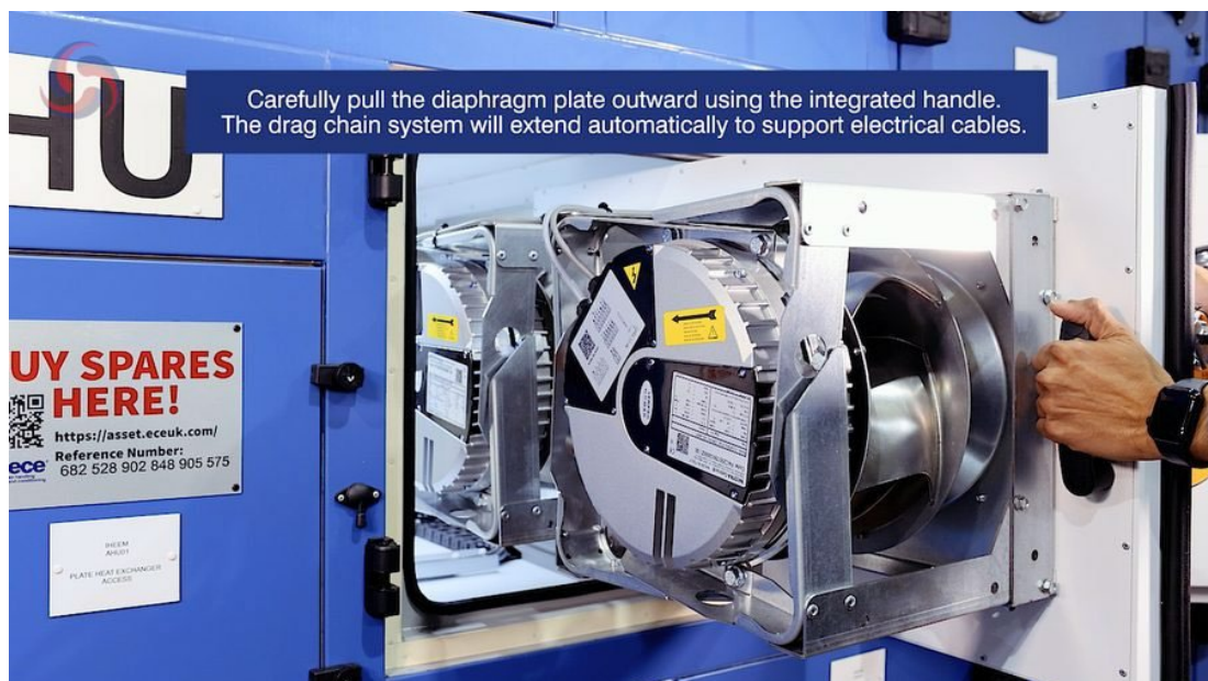
Figure 4. Carefully pulling the diaphragm plate outward using the integrated handle — the drag chain extends to support the electrical cables.

Do not strain or twist the drag chain cables.