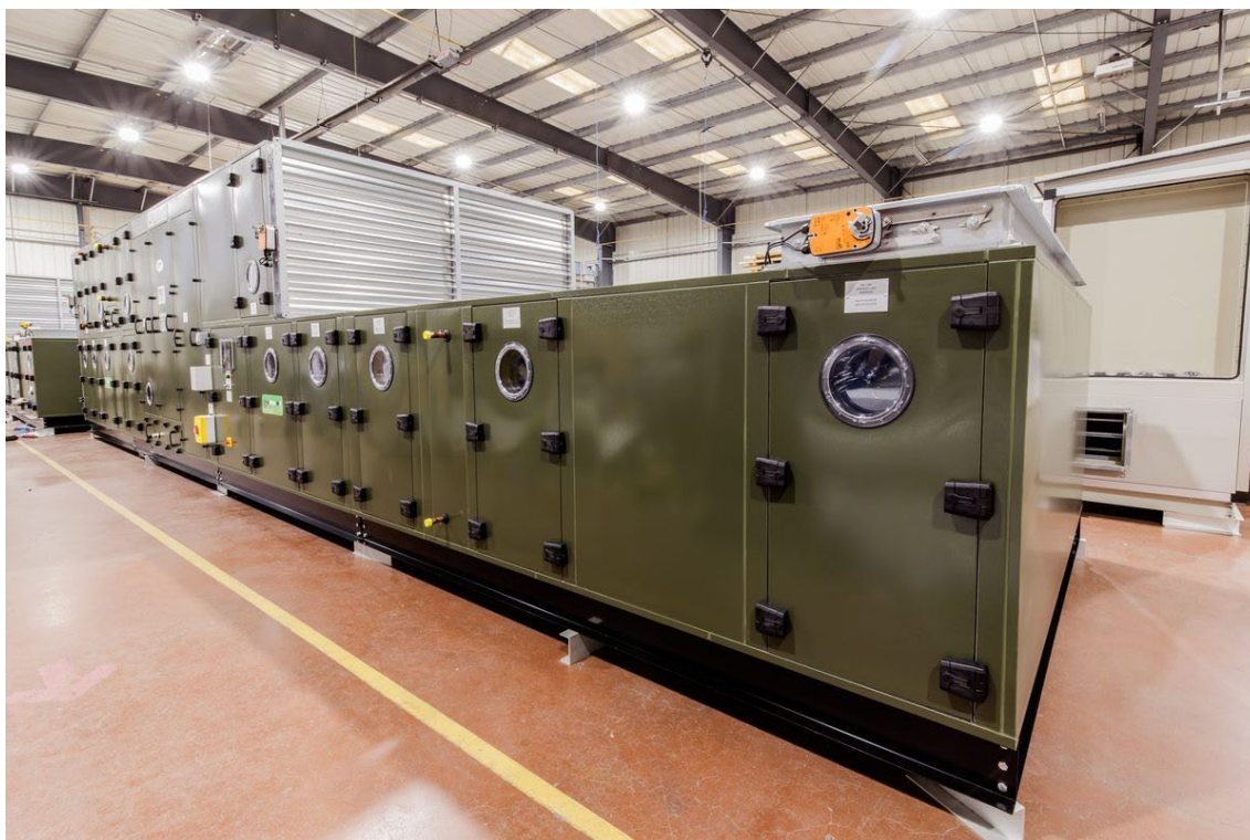
Figure 1. Typical ECE air handling unit with EC plug fan. Correct fan rotation direction is critical to deliver designed airflow performance and protect the motor.