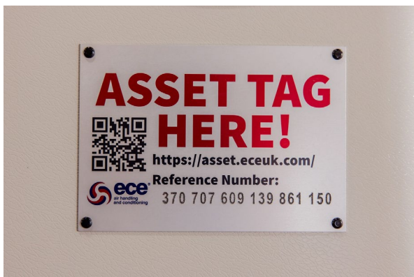
Figure 3. Asset Tag plate carrying the unique 18-digit reference number used to retrieve AHU technical information from the ECE Client Portal.